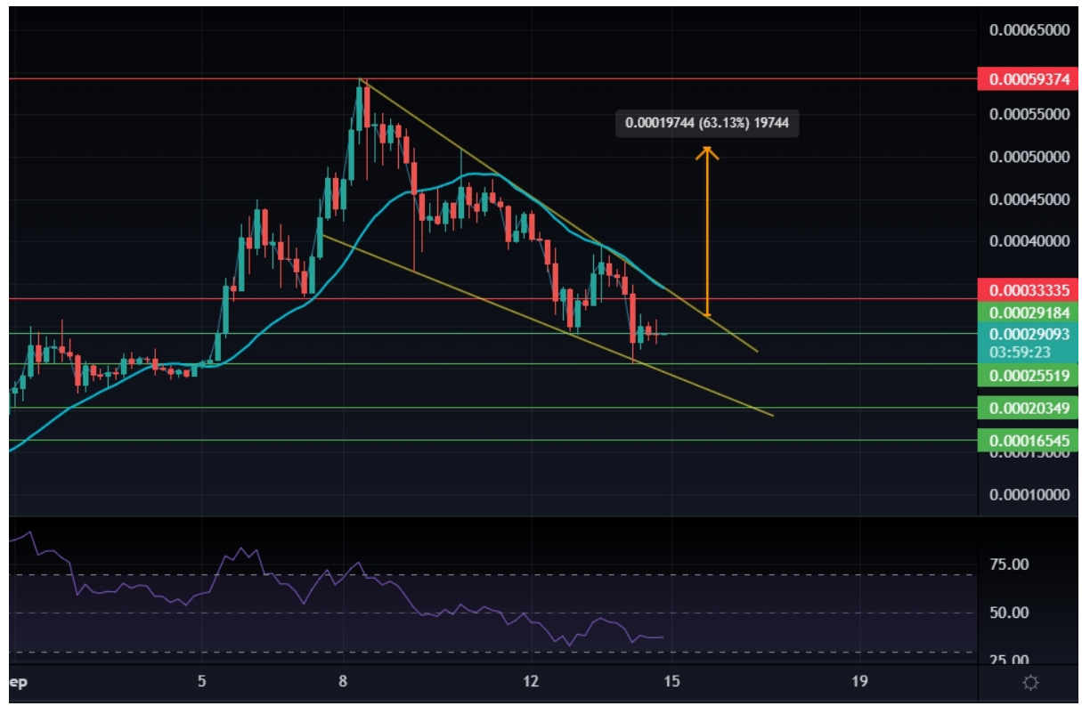
LUNC/BUSD - 4 Hour Time Frame.

An obvious downward trend in LUNC's price can be seen in the above chart during the past few days. Before the decline, LUNC was setting new highs and highs off of the 20-day moving average, indicating a healthy upward trend.