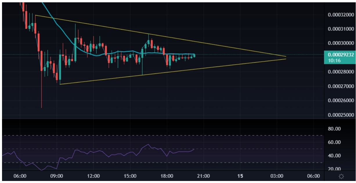
LUNC/BUSD - 15 Minute Time Frame

If we examine the 15-minute time frame for Terra Classic, we can observe a symmetrical triangle pattern forming. This is a consolidation continuation pattern, and although it could lead to a decline below $0.00027, I think bulls have a better chance of winning this round.