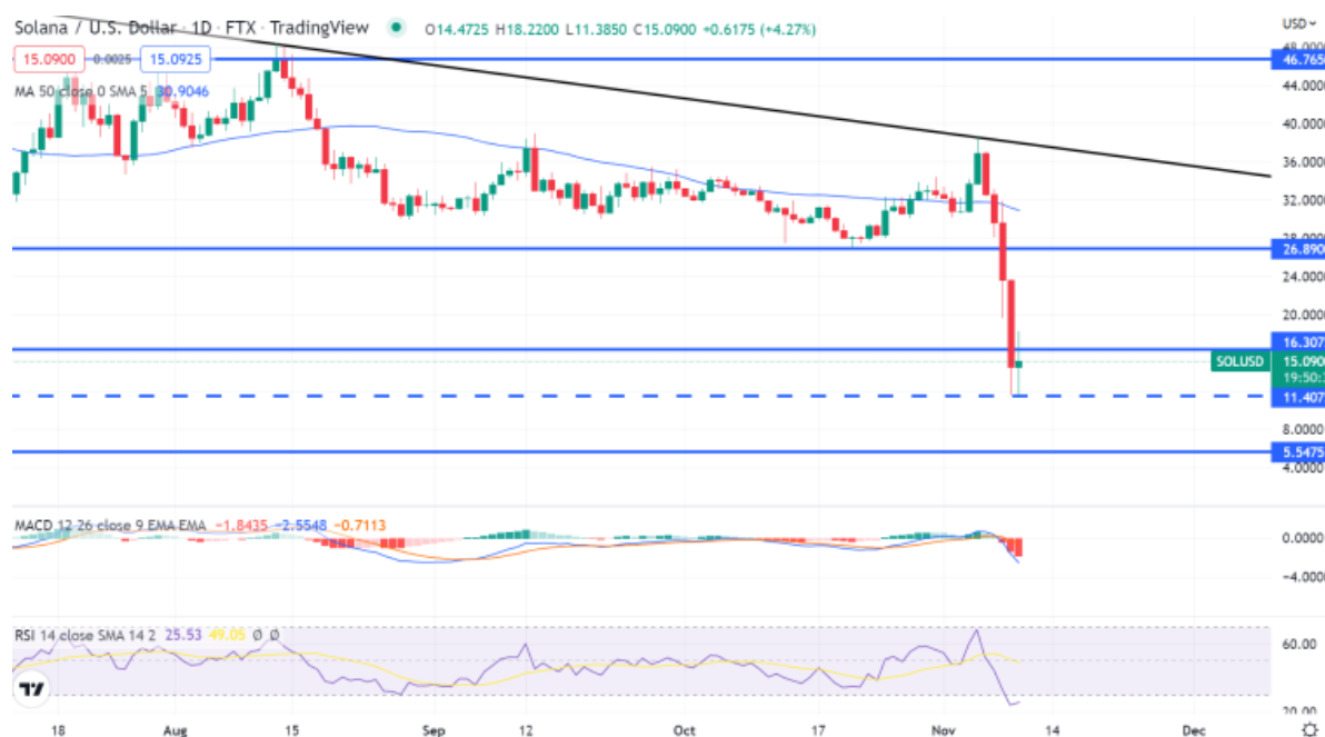
Solana Price Chart - Tradingview

Solana is currently trading at $15.18 with a 24-hour volume of $4.9 billion. Solana has fallen by 40% in the last 24 hours. CoinMarketCap is now ranked 13th with a market valuation of $5.5 billion. There are now 362 331 154 SOL in circulation.