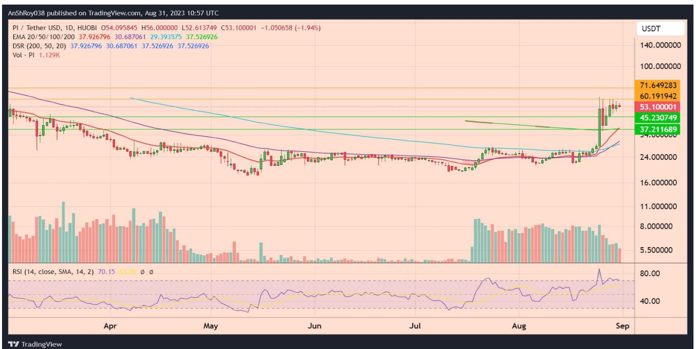
PIUSD daily price chart with RSI.

Since August 27th, the price of PI coins has increased by approximately 42%, reaching a daily high of almost $56 on August 31st. Recent daily candles for this coin show that bears remained active with lengthy upper wicks near the $60.2 resistance.