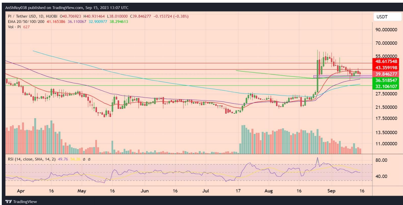
PIUSDT daily price chart with RSI

If the nearby support fails, however, PI price may head toward the $32 support area marked by the 100-day exponential moving average (blue wave).