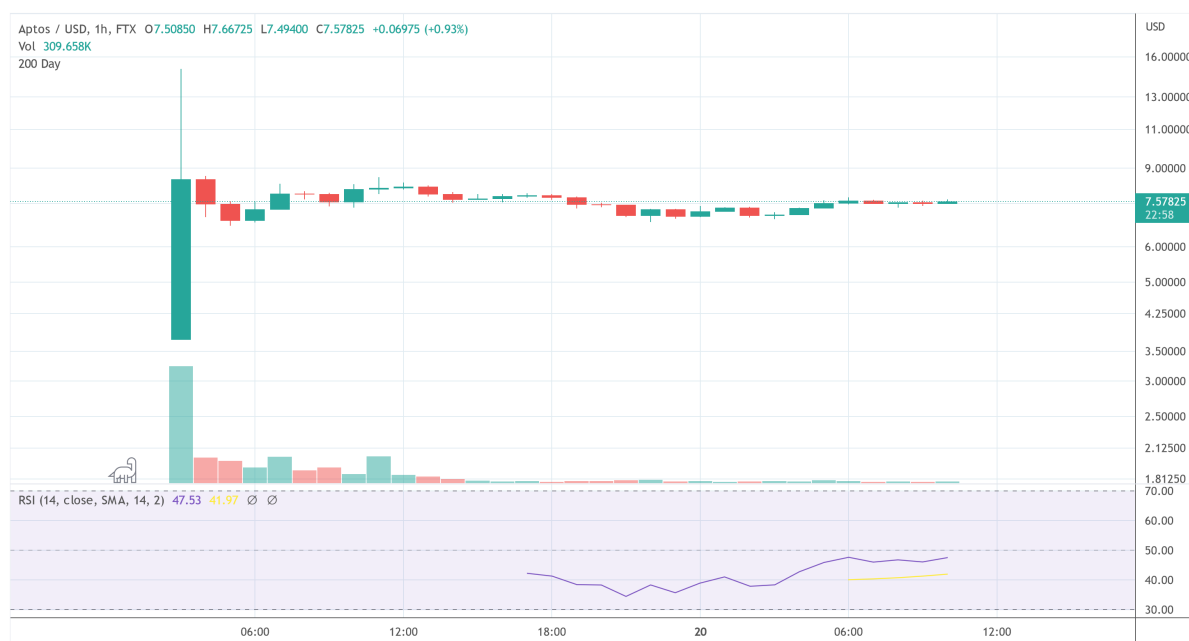
TradingView APT trading sideways after launch.

Meanwhile, after being listed yesterday on every major exchange, Aptos' APT token is moving sideways.