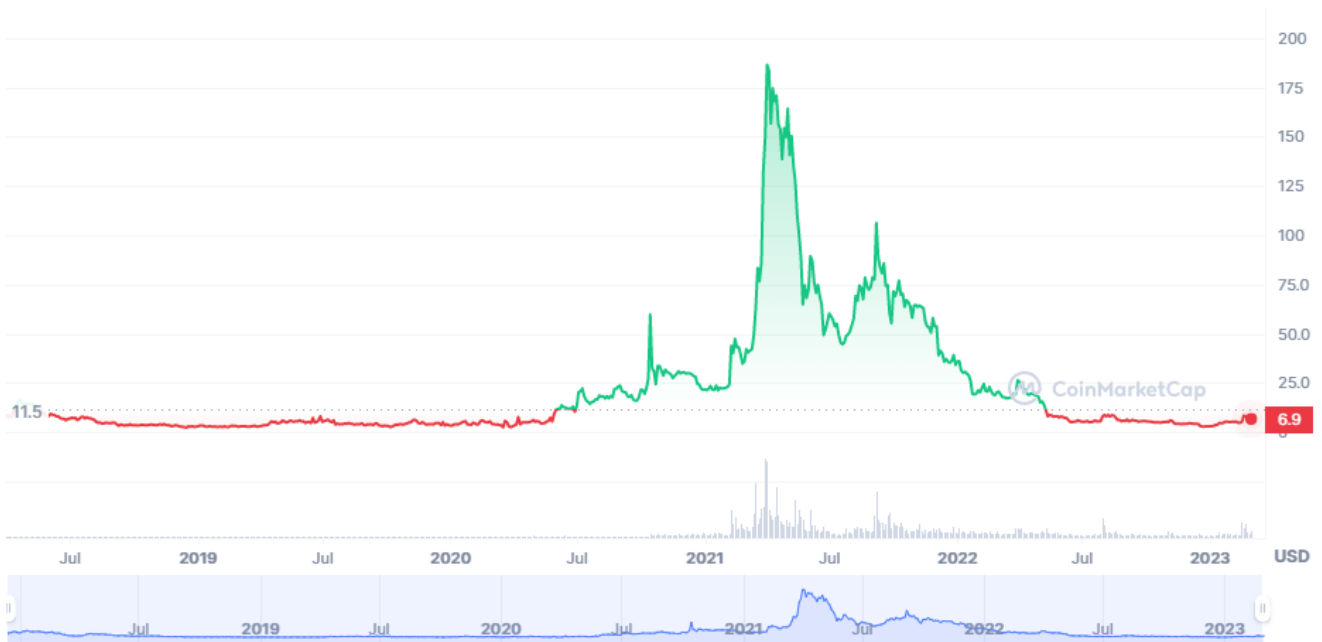
FIL price history from launch to present