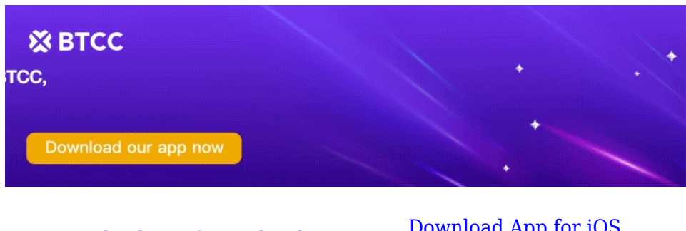
Download App for Android

But if things don't go as planned and the digital asset is attacked by false information and skepticism (FUD), then the opposite is true. Assuming no further price drops occur, the altcoin's value would bottom out at $0.518. All things considered, a price of $0.73 per coin seems reasonable for the digital asset.