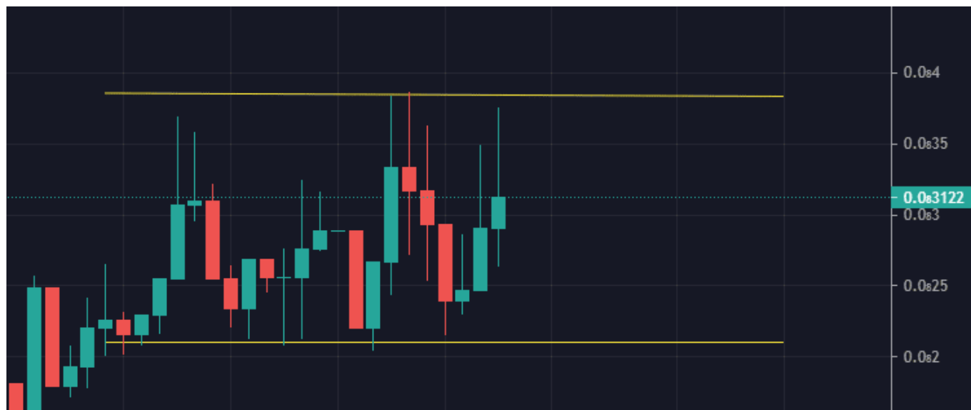
DINU/USD - Horizontal Channel, Daily Time Frame.

prices, this has the potential to yield a return of more than 100%. (extremely risky, do your own research).