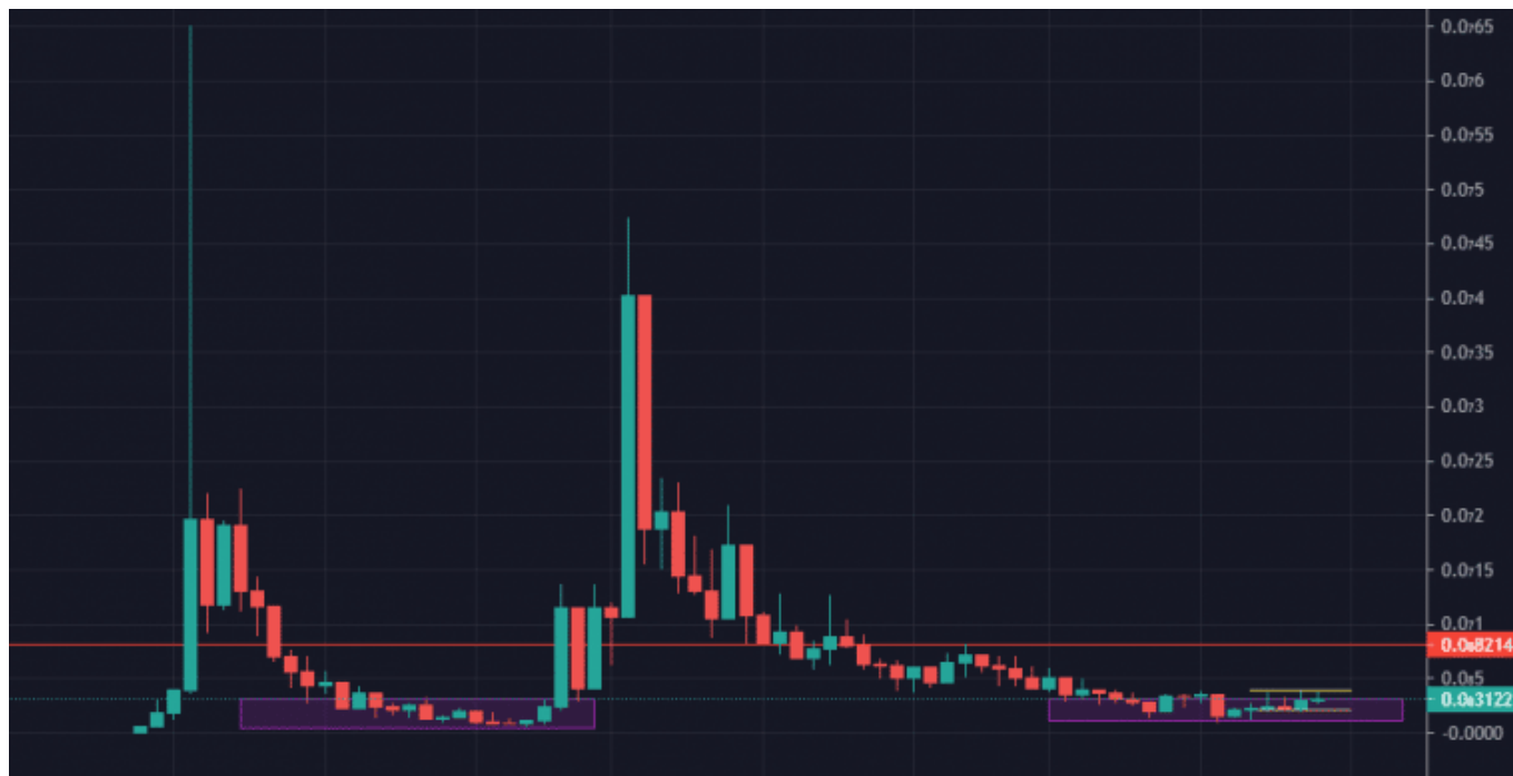
DINU/USD - Weekly Time Frame.

When May 2021 rolled around, $0.000000065 was Doge Inu's (DINU) all-time high point. The subsequent 99% price drop occurred in the summer of 2021. (left purple rectangle, accumulation range). Almost immediately after this low, Doge Inu (DINU) began a parabolic recovery, eventually reaching a high of $0.0000000476, a gain of 8,275% from its trough.