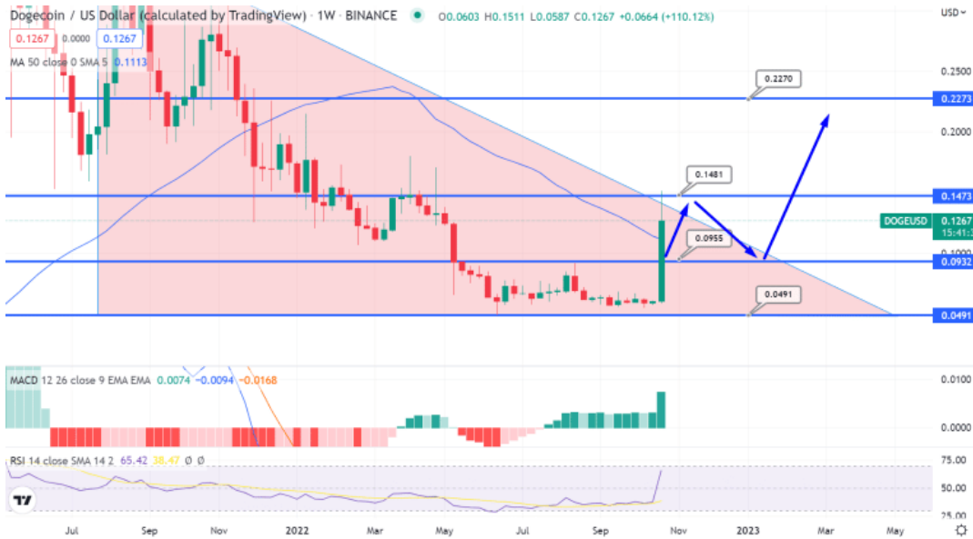
DogeCoin Price Chart

Technically speaking, the $0.14 level, which is being stretched by a bearish trendline, continues to act as resistance for Dogecoin.