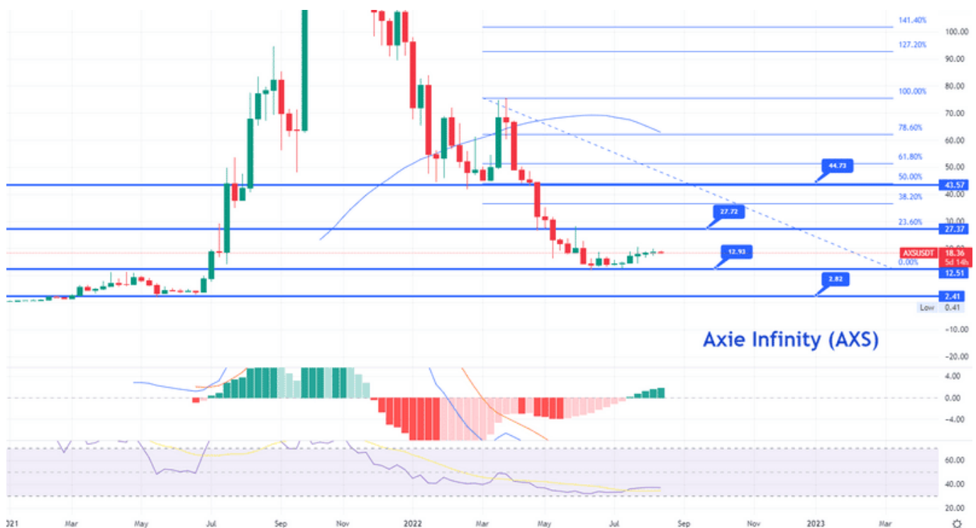
Axie Infinity Price Chart

Axie Infinity is trading at $18.32 right now, with a 24-hour volume of $168 million. The value of Axie Infinity has increased by 0.60 percent over the past 24 hours. With a current market worth of $1.5 billion, CoinMarketCap has risen to the #40 spot. The total supply of AXS coins is 270,000,000, and currently there are 83,814,110 in circulation.