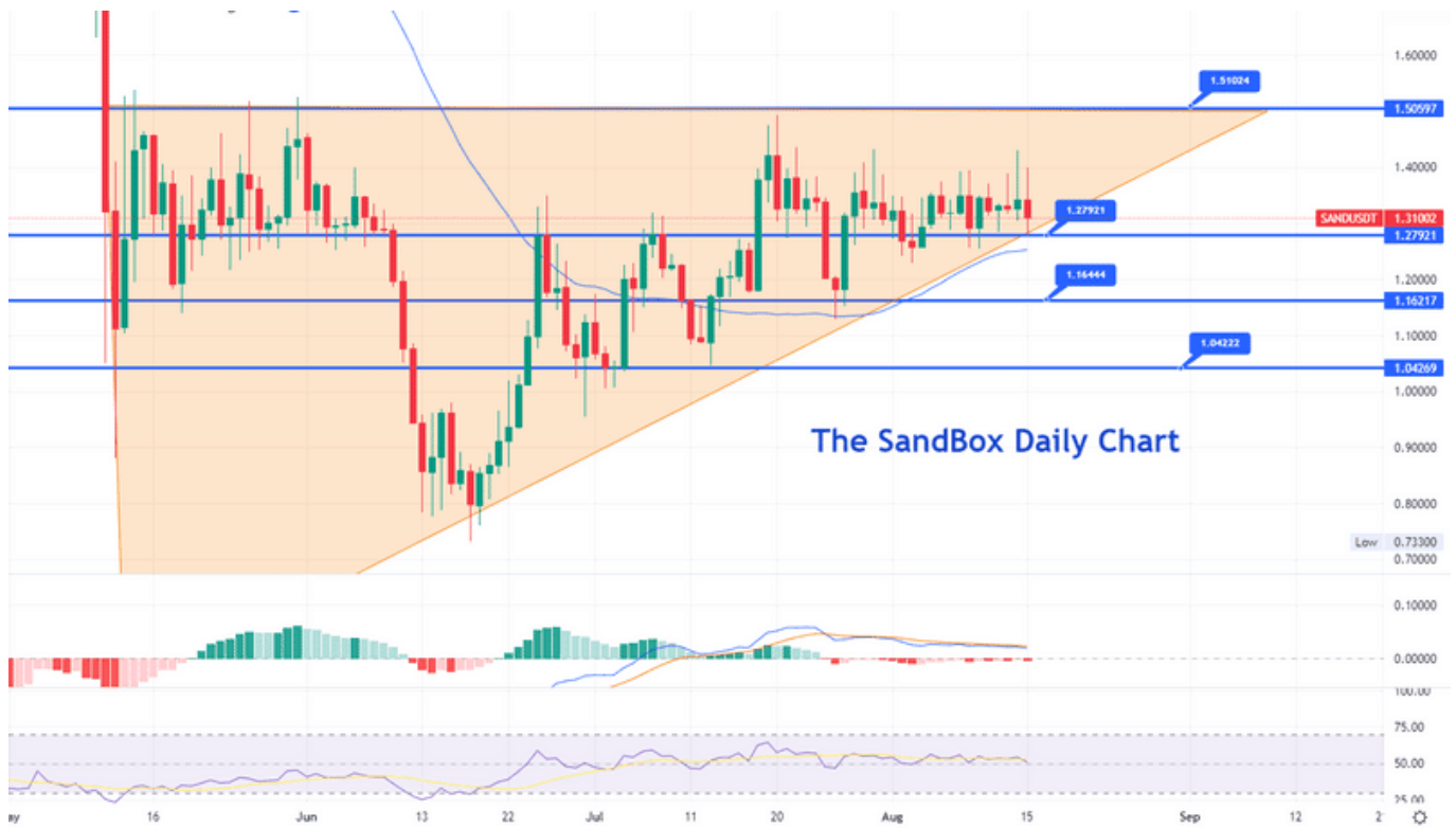
SandBox Price Chart