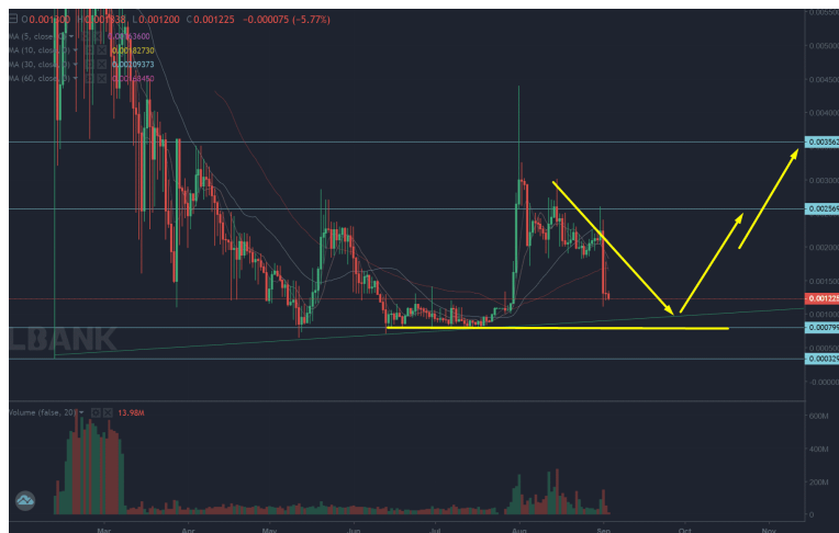
IBAT Price Chart

Despite the fact that Battle Infinity's price is currently correcting down, the rising trendline is predicted to keep the cryptocurrency's value stable at $0.00080. Due to the triple top resistance level sitting at $0.002579, the price of IBAT has been unable to rise over this level.